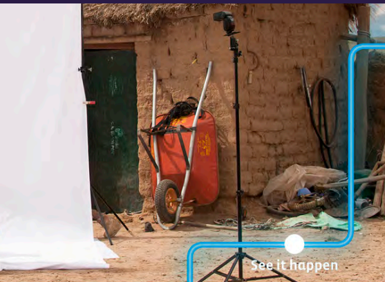
See it happen