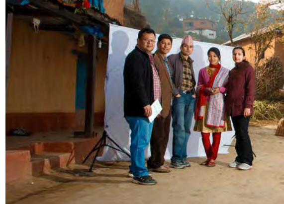
Nepal WASH Alliance

This four year, €27 million programme uses the popularity and energy of football to improve hygiene education, drinking water and sanitation, initially in more than 1000 schools in Ghana, Mozambique and Kenya. Partners include the Dutch Royal Soccer Union (KNVB), UNICEF, Simavi, Aqua for All, Vitens Evides International and the