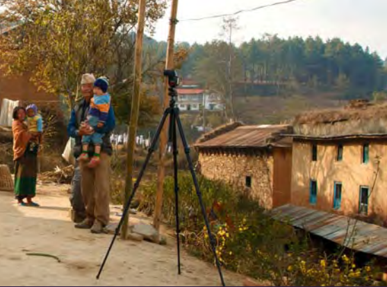
Nepal Akvo FLOW and RSR